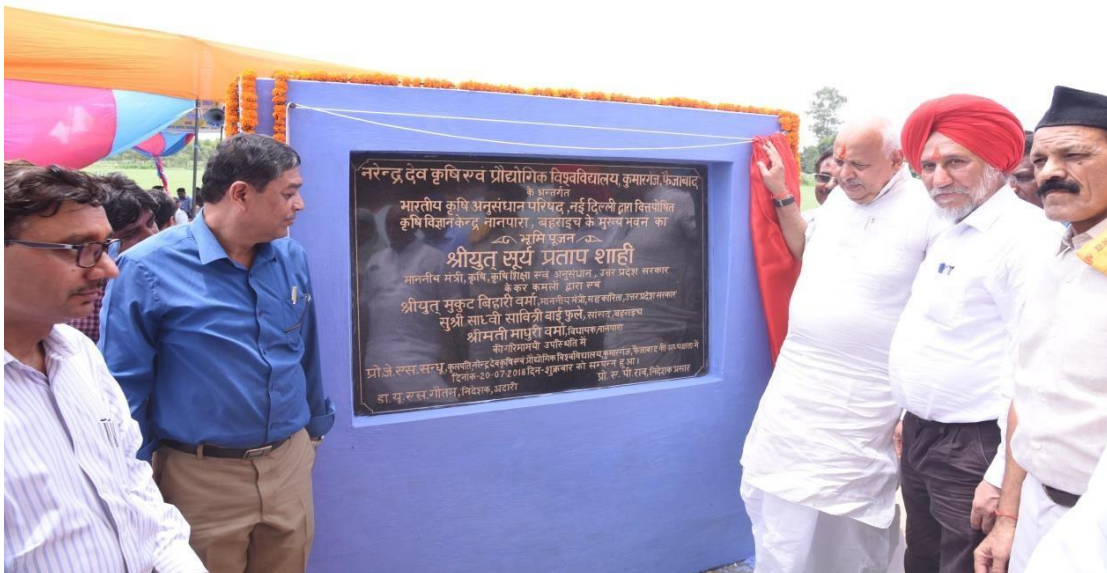
HON'BLE AGRICULTURE MINISTER INAUGURATED KVK NANPARA, BAHAIRACH AT THE TIME OF KISAN MELA ON DATED 20 JULY 2018