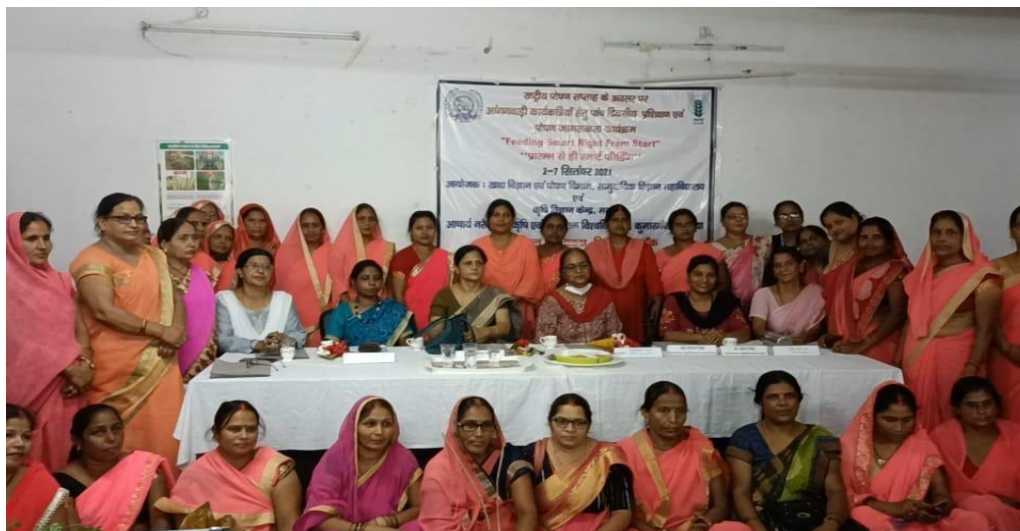
INTERACTION OF EXPERT DURING WORKSHOP ON FEEDING SMART RIGHT FOR ANGANWADI WORKERS ON DATED 7 SEPTEMBER 2021