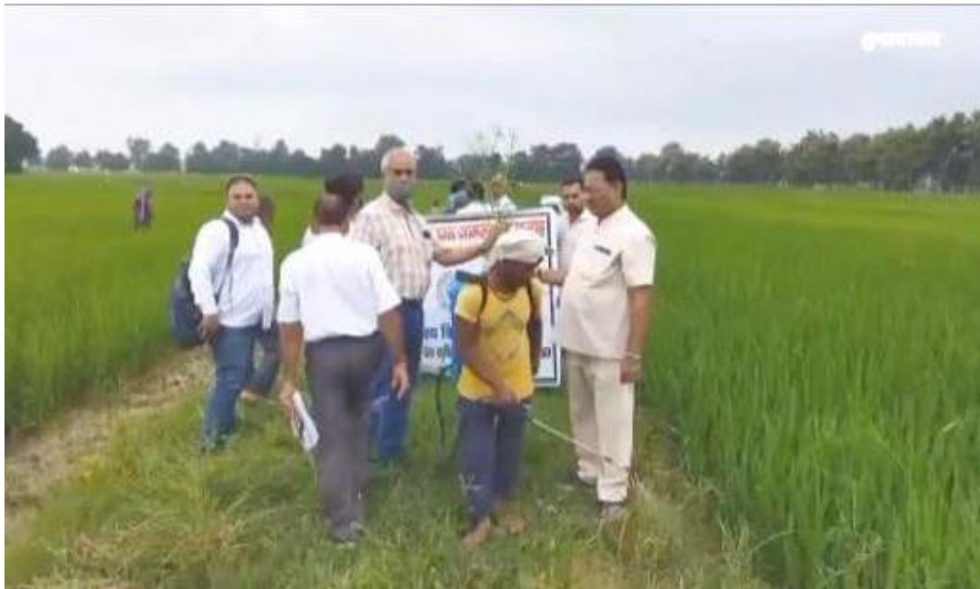
CAPACITY BUILDING BY SCIENTIST ON FERTILIZER APPLICATION AT FARMERS FIELD ON DATED 16 AUGUST 2021