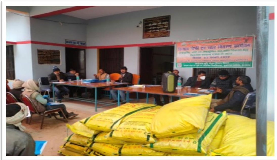
SCIENTIST INTERACTED WITH FARMERS & FERTILIZER DISTRIBUTION AT AMANIGANJ BLOCK, AYODHYA ON DATED 3 FEBRUARY 2022