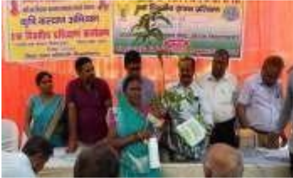
SEEDLING DISTRIBUTION BY SCIENTIST DURING KISAN GOSTHI ON BEST MANAGEMENT PRACTICES OF MANGO ON DATED JULY 2019