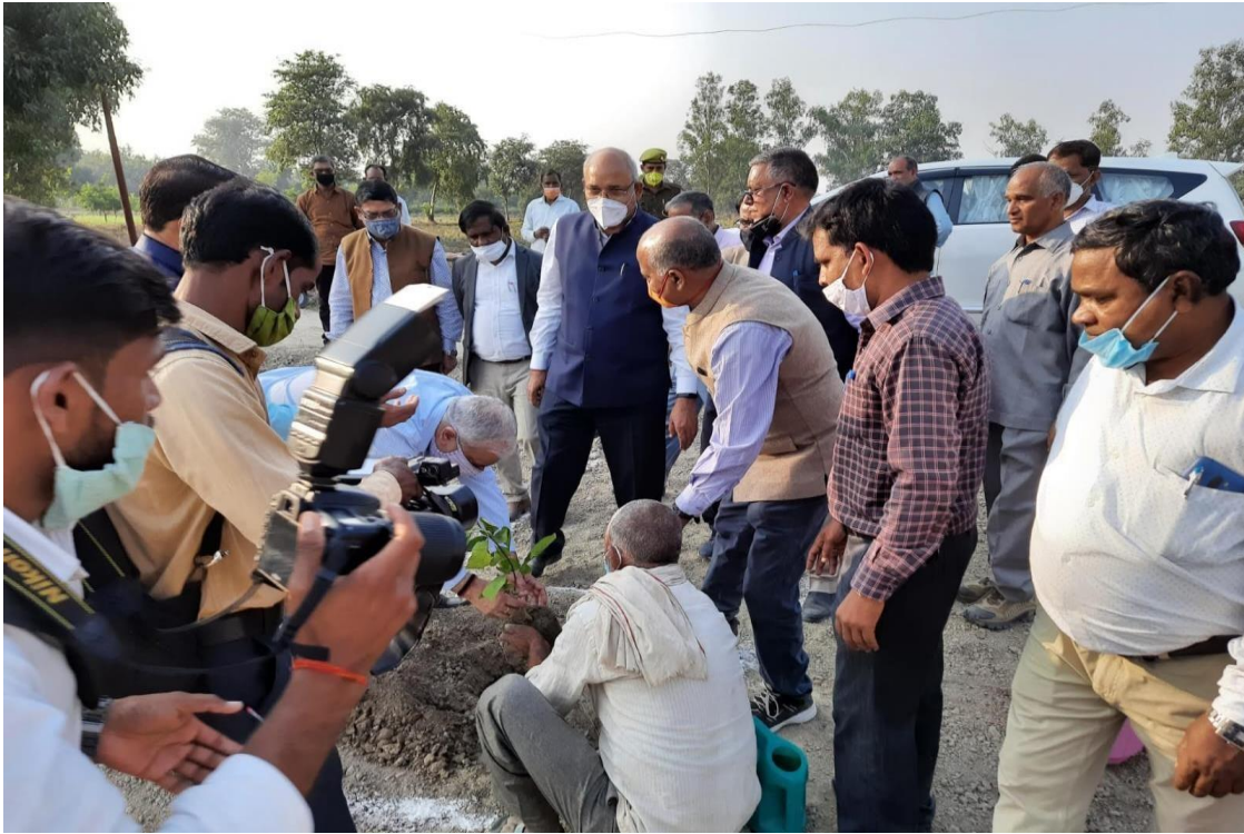
PLANTATION BY HON'BLE VICE CHANCELLOR AT THE TIME OF WORLD FORESTRY DAY ON DATED 21 MARCH 2020