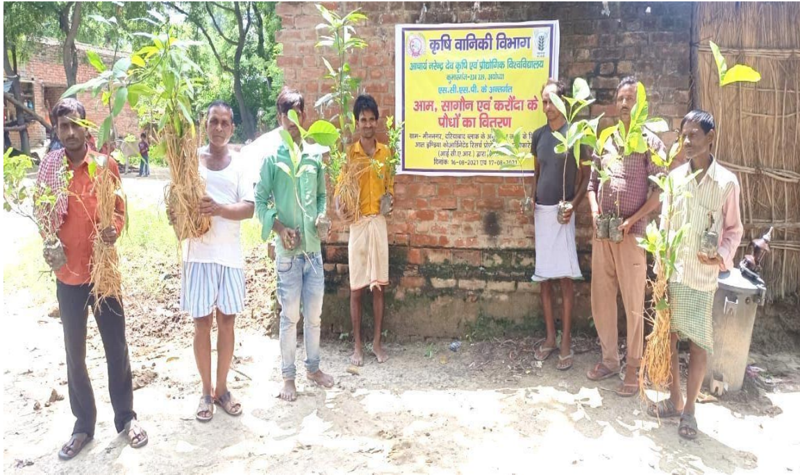
SEEDLINGS OF DIFFERENT TREE SPECIES WERE DISTRIBUTED IN VILLAGES BY DEPARTMENT OF AGROFORESTRY ON DATED 16 OCTOBER 2021