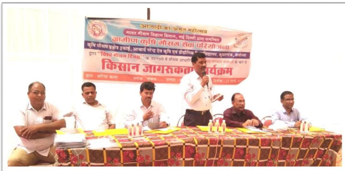
FARMERS AWARENESS PROGRAMME & SEEDLING DISTRIBUTION ON WORLD METEOROLOGY DAY (3 MARCH, 2022)