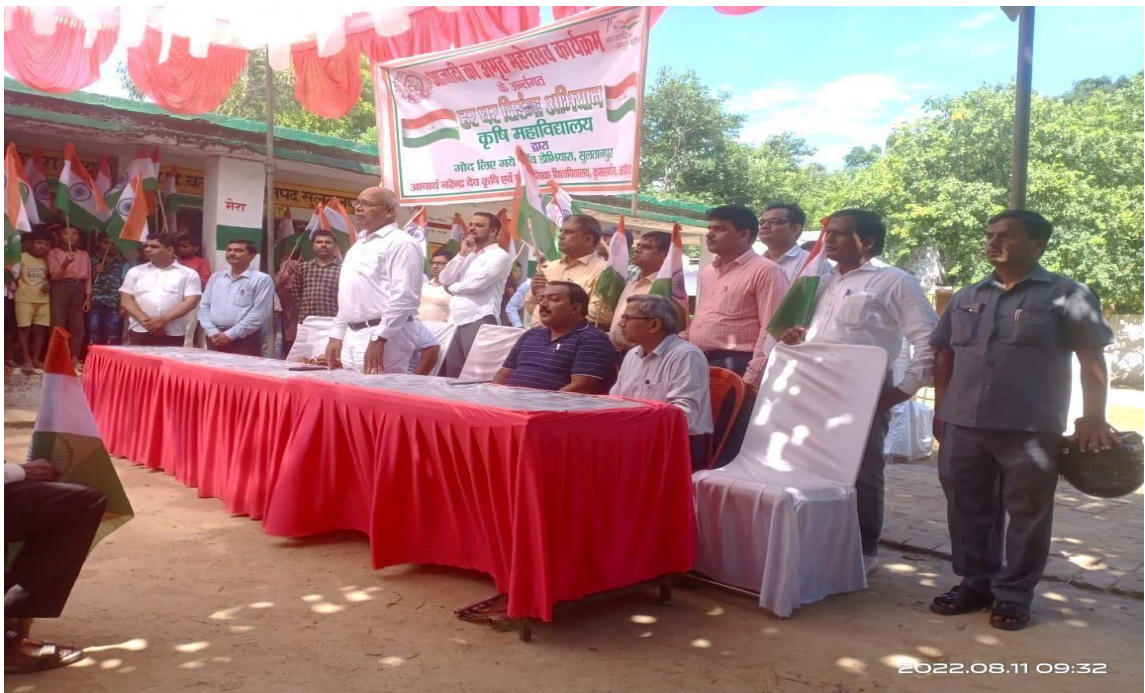
HON'BLE VICE CHANCELLOR ADDRESSED THE VILLAGERS ON EVENT HAR GHAR TIRANGAON ON DATED 30 NOVEMBER 2022