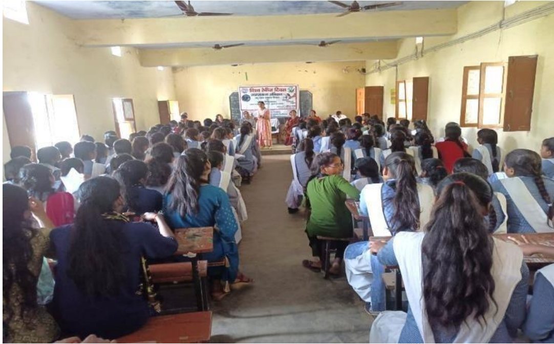
WORLD RABIES DAY –AN AWARENESS PROGRAMME BY EXPERT IN NEARBY COLLEGEON DATED 28 SEPTEMBER 2022

The college of community science organized programme to raise awareness about rabies prevention and highlight progress in defeating this disease.