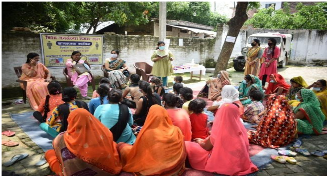
AWARENESS OF RURAL WOMEN'S AT THE TIME OF WORLD POPULATION DAY PROGRAMME ON DATED 11 JULY 2021

The faculty members of Department of Food Science and Nutrition delivered lectures on World Population Day Celebration 11 th July 2021. They addressed the adolescent girls and rural women about consequences of population and also discuss about the factors which reduce the rate of maternal and child mortality. Nutritious recipe competition for rural adolescent girls was held and discussions were done on breast and cervical cancers, institutional deliveries and immunization among children, malnutrition among women and children and its management in the village Lalkapurwa.