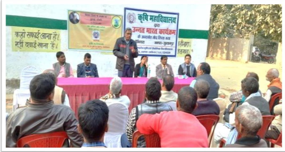
SCIENTISTS SHARED THE VALUABLE INFORMATION THROUGH AGRI-ENTREPRENEURSHIP PROGRAM ON FARMERS DAY (23 DECEMBER 2021)