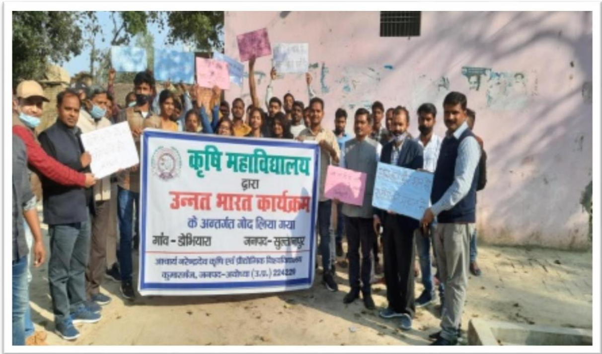
VOTER AWARENESS UNDER UNNAT BHARAT PROGRAMME TO ENCOURAGE FOR 100% POLLING ON DATED 25 JAN 2022