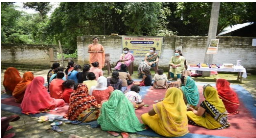
INTERACTION OF RURAL WOMENS WITH EXPERT AT WORLD POPULATION DAY