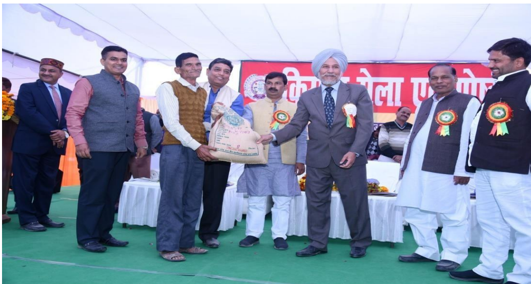
INTERACTION WITH FARMERS DURING KISAN MELA & SEED DISTRIBUTION BY HON'BLE VICE CHANCELLOR