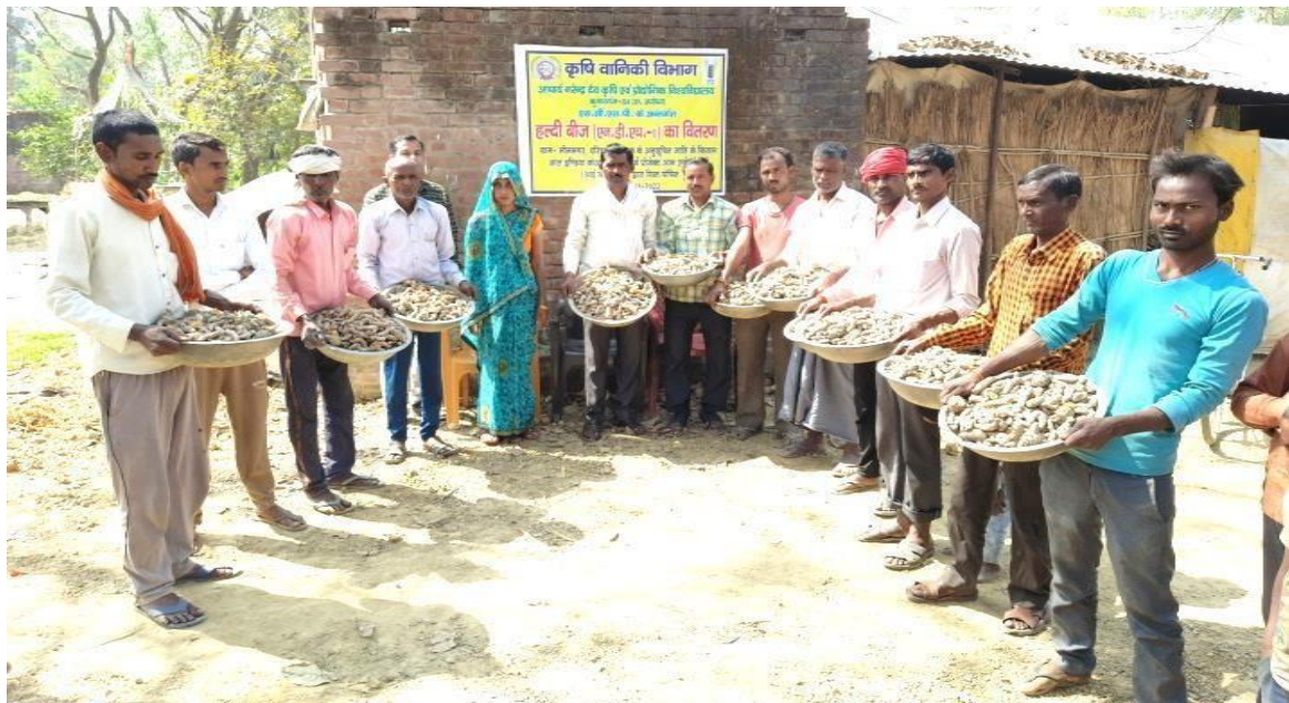
SEED DISTRIBUTION OF VEGETABLE & SPICES UNDER ALL INDIA COORDINATED RESEARCH PROJECT (AGROFORESTRY) BY EXPERT 9 MARCH 2022