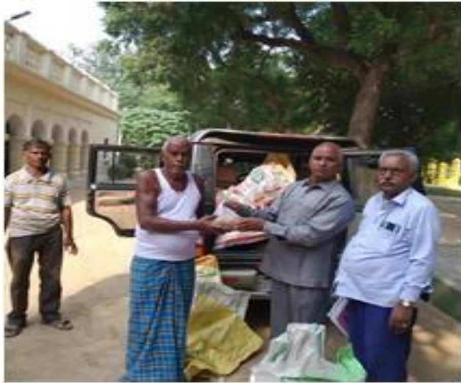
AWARENESS AND DISTRIBUTION PROGRAMME ON SPICES AT DISTRICT SULTANPUR AND AMETHI