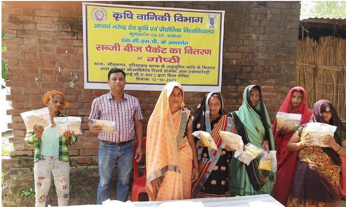
SEED DISTRIBUTION AT THE TIME OF KISAN GOSTHI ON CULTIVATION OF VEGETABLE CROPS UNDER AGROFORESTRY ON DATED 12 OCTOBER 2021