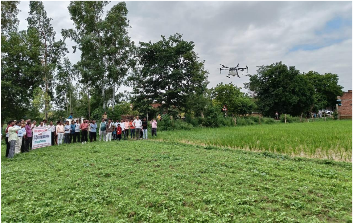
DEMONSTRATION OF DRONE AT FARMERS FIELD UNDER THE EXPERT SUPERVISION ON DATED 30 NOVEMBER 2022