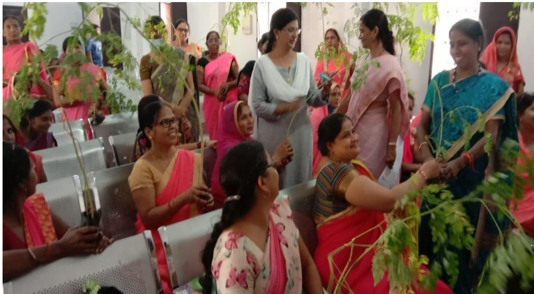
MORINGA SAPLINGS DISTRIBUTED BY THE FACULTIES DURING NATIONAL NUTRITION WEEK

Dept. of Food Science and Nutrition faculty members organized awareness cum workshop on Feeding Smart right from Start for anganwadi workers. The main aim of the programmes is to raise public awareness about nutrition and healthy eating habits. n This programme was the part of Nutrition week celebration(02- 07 September 2021). During this programmes lectures were organized on menstrual hygiene, weaning foods for infants and demonstration on iron and calcium rich recipes using locally available foods were done. Moringa sapling was distributed by the faculty members to the anganwadi workers.