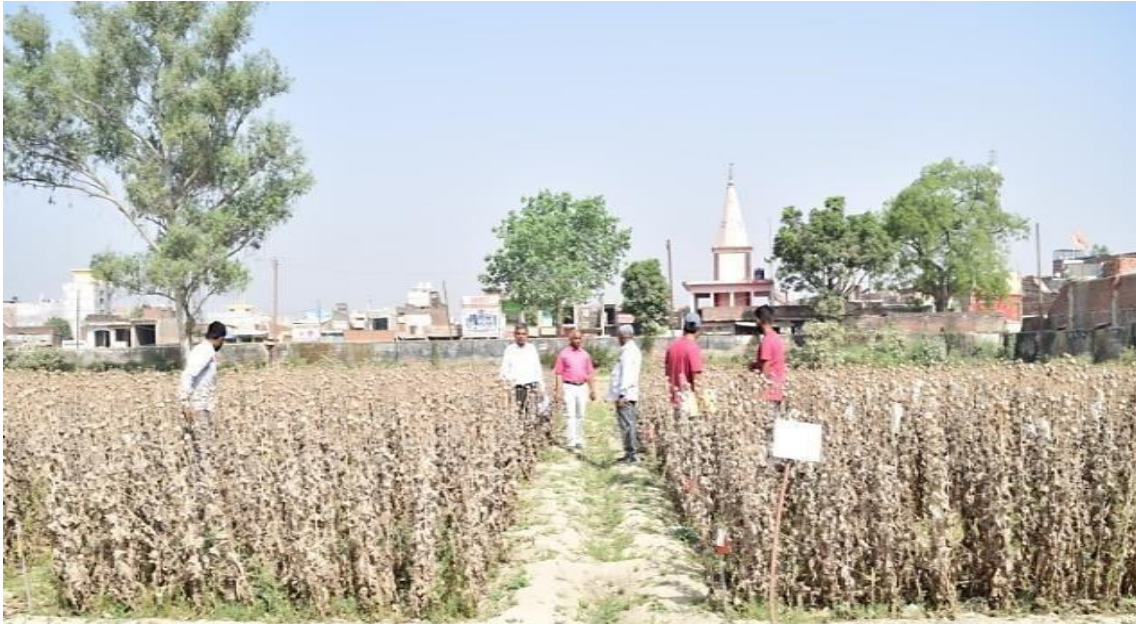
COLLEGE TEAM VISITED DEMONSTRATION FIELD OF OPIUM POPPY DURING KISAN GOSTHI ON DATED FEBRUARY 2021