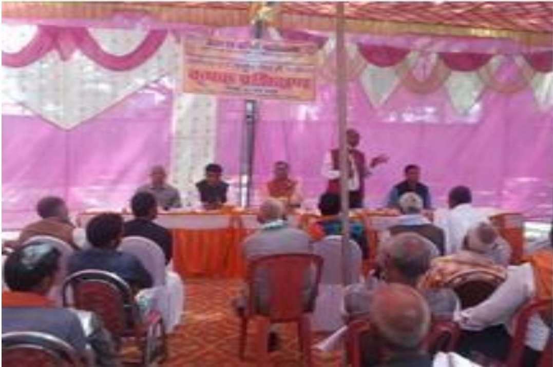
EXPERT AT THE TIME OF FARMERS TRAINING ON HORTICULTURAL CROPS AT NEARBY VILLAGE ON DATED JULY 2019

All extension programmes of the university were planned, organized and monitored by the directorate in closed collaboration with different departments of constituent colleges of the university, different departments of the state Governments, ICAR and other extension agencies.