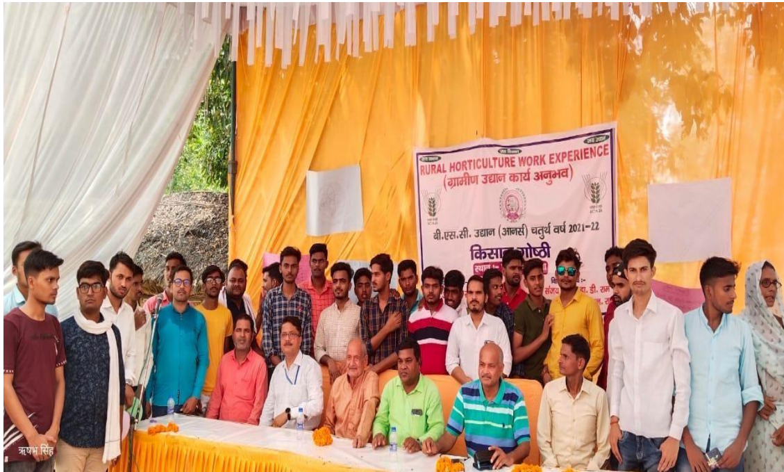
KISA GOSTHI ON COMMERCIAL CULTIVATION OF MEDICINAL & AROMATIC PLANTS BY THE EXPERT IN NEARBY VILLAGE ON DATED JULY 2021