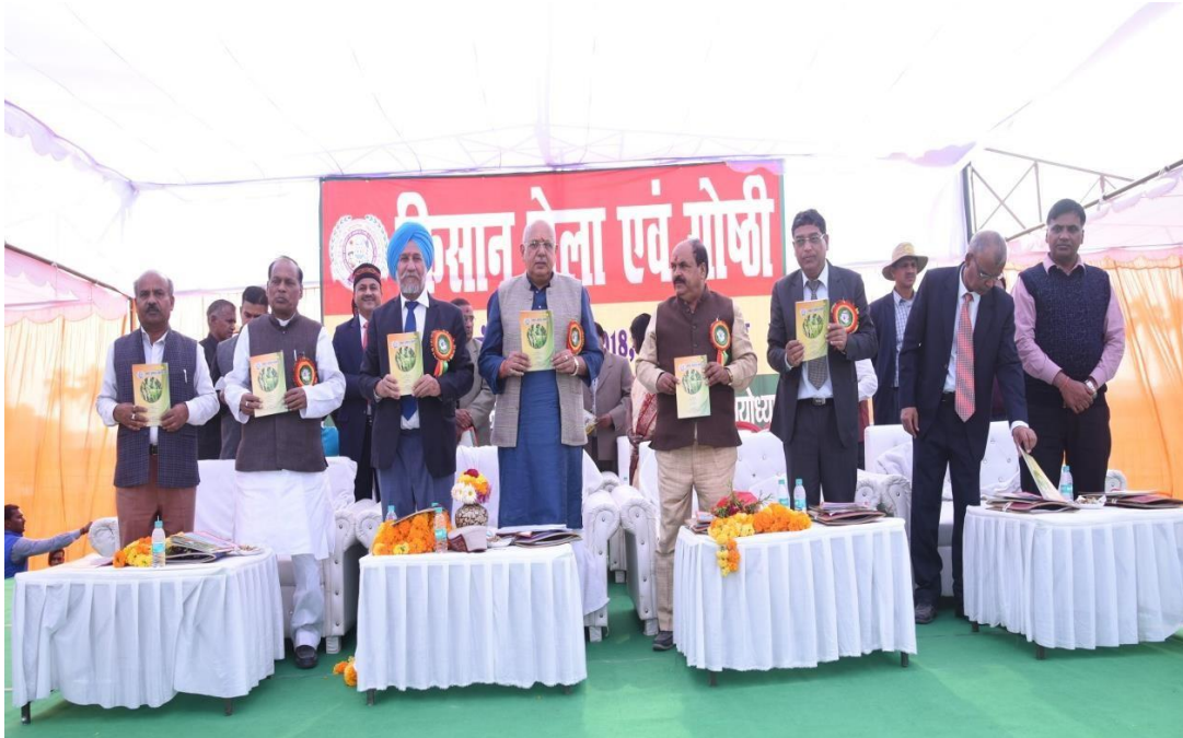
HON'BLE AGRICULTURE MINISTER AND VICE CHANCELLOR INAUGURATED A MANUAL TITLED "CROP PRODUCTION TECHNOLOGY" AT THE TIME OF KISAN MELA (20 JULY 2018)