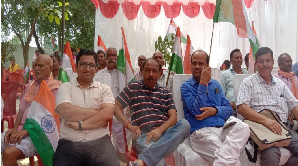
INTERACTION WITH FARMERS ON MATDATA DIWAS UNDER AWARENESS PROGRAMME IN MILKIPUR BLOCK BY EXPERT ON DATED 30 NOVEMBER 2022

During the session 2017-2021 most of the activities was organized and inaugurated by the Hon'ble Minister of Agriculture, Government of UP. Through the events, subject expert of university had shared the information on modern agriculture technology, importance of soil and its required nutrient, high yielding variety, scientific cultivation of vegetable & fruit crops and encouraged farmers on above point through Kisan Mela, Exhibition, Kisan goathi. Most of the neighbouring villagers of surrounding districts had actively participated and got benefitted.