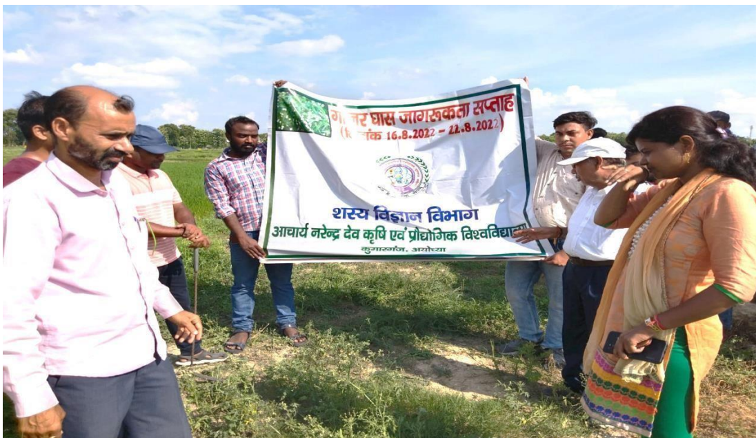
COLLEGE TEAM VISITED AT FARMERS FIELD DURING AWARENESS PROGRAMME ON GAJAR GHASON DATED 16 AUGUST 2022