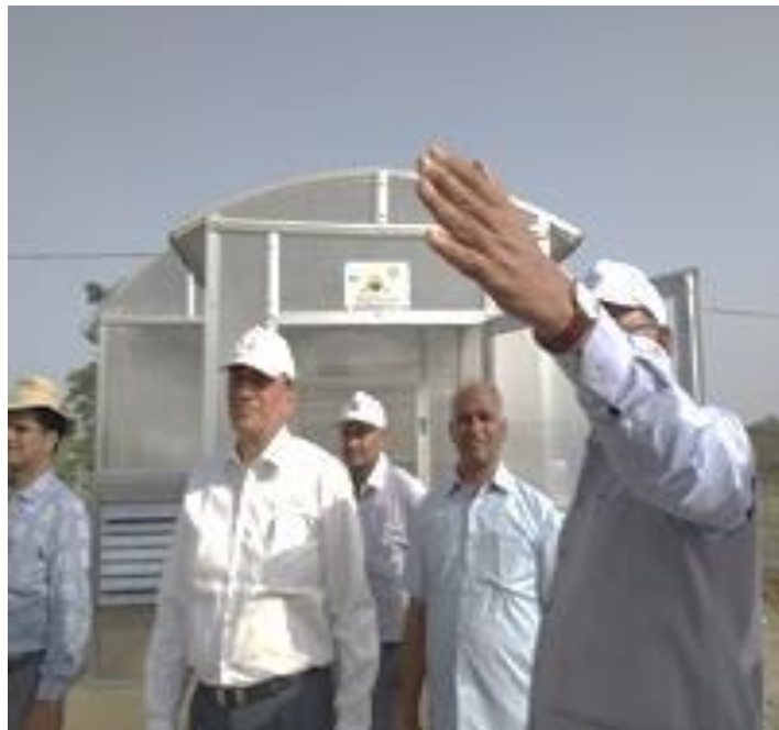
EXPERT VISIT AT MIDH NURSERY DURING AWARENESS PROGRAMME ON RAISING OF YOUNG VEGETABLE SEEDLINGS