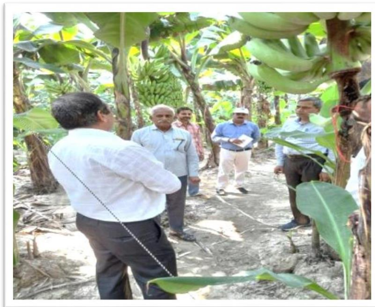
INTERACTION WITH THE FARMERS ON VALUE ADDITION OF BANANA CROPS AND DOUBLING OF INCOME ON DATED 25 OCTOBER 2021