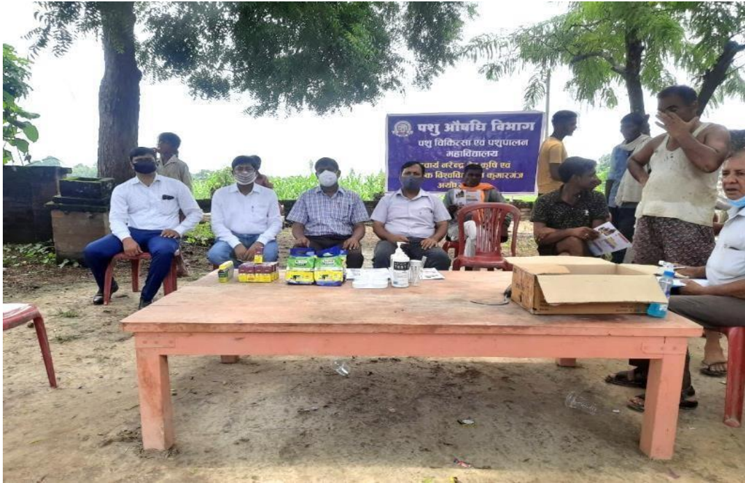
EXPERT INETRACTION WITH FARMERS DURING CAMP ON DIAGNOSE THE NEGATIVE ENERGY BALANCE IN THE ANIMALS AT AKMA VILLAGE ON DATED 15 JANUARY 2021