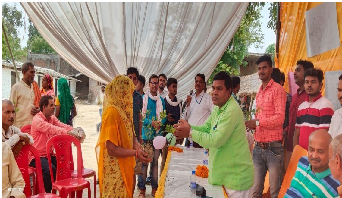
SEEDLING DISTRIBUTION BY THE EXPERT TO ENCOURAGE CULTIVATION OF MAP CROP IN NEARBY VILLAGE