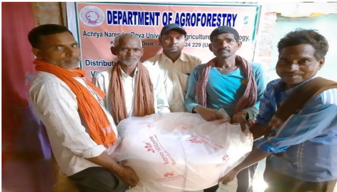
PVC IRRIGATION PIPE DISTRIBUTED BY DEPARTMENT OF AGROFORESTRY IN DIFFERENT VILLAGES ON DATED 22 MARCH 2021