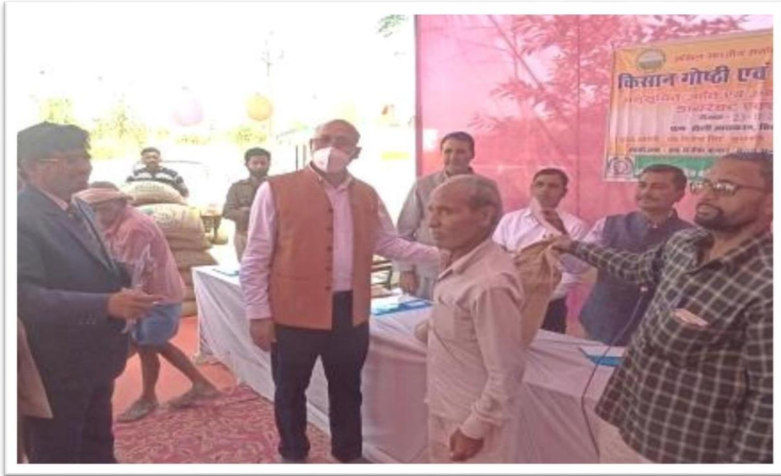
DISTRIBUTION OF HON'BLE VICE CHANCELLOR TO SC/ ST FARMERS DURING DIRECT ACTION PLAN OF AGROMETEOROLOGY ON DATED 23 NOV 2021