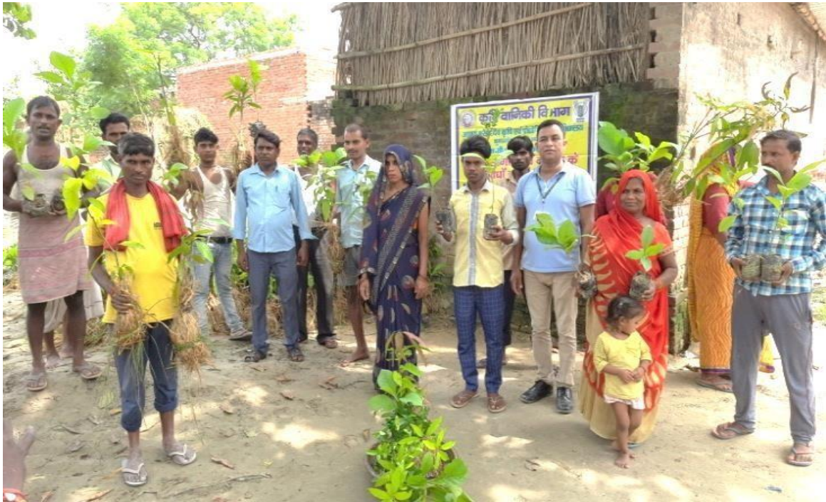
TREE SEEDLINGS DISTRIBUTED BY EXPERT DURING AWARENESS PROGRAMME ON AGROFORESTRY IN VILLAGES ON DATED AUGUST 2021