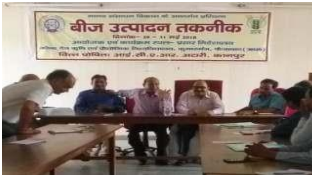
TECHNICAL LECTURE ON SEED PRODUCTION TECHNOLOGY BY THE EXPERT TO PROGRESSIVE FARMERS ON DATED 10 MAY 2018